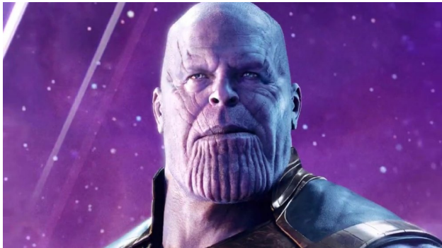
Figure 1 - Thanos

Thanos is one of the most powerful beings in the universe and he has ahold of four of the Infinity Stones. The alliance is aware that if they lose control of the two stones they have now, Thanos will be able to put his plan into action killing half of all life in the universe. With this in mind, the newly formed group is divided on this issue and cannot come to a consensus of whether they should use the power of the stones and fight or hide, keeping the stones safe.