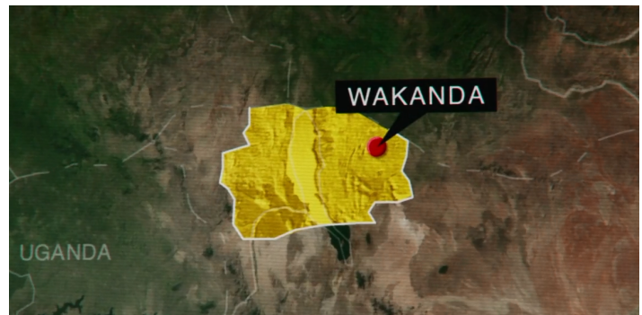
Figure 3- Wakanda on map

Wakanda and their Vibranium have always been hidden from the rest of the world until recently. Vibranium is a very powerful and versatile material. It is the strongest metal known to man and 1/3rd the weight of steel. It powers Wakanda's cities and weapons; it is sewed into their clothes and is a vital part of Wakandan culture.