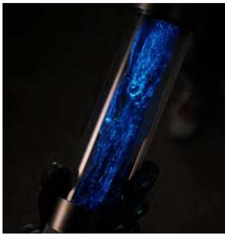
Figure 4- Vibranium

sharing their Wakandan resources and knowledge with the rest of the world for the first time in the nation's history. It is unclear what inspired this change. We do know, however, that T'Challa is willing to share Wakandan Vibranium. World Leaders and noted "superhero" team, The Avengers, remain divided on the best uses for this material. Billionaire playboy Tony Stark has expressed interest in combining the tech with his "Iron man" designs. General Ross has clashed with Stark on this, claiming the Vibranium should be solely in the possession of the US government. A meeting will take place amongst The Avengers to determine the best use for the valuable material.